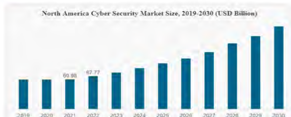
Figure 1: North America Security Market Size